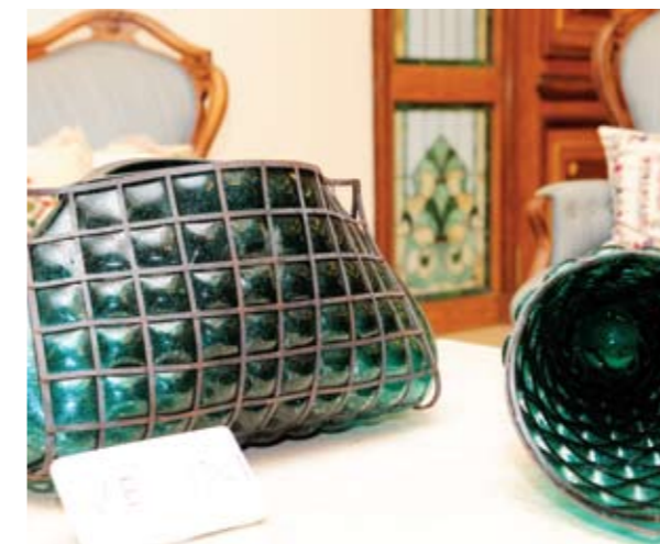
Venini Murano Glass

We personally own a number of Venini glasses. The Embassy owns a collection of a specially designed series of glasses that we keep on using for a limited number of guests. Moreover, the Embassy hosts one of the most exclusive pieces of furniture by Maestro Caggiano on a permanent basis.