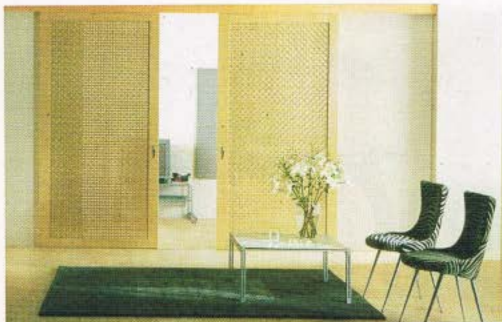
The Exit 01 model from Bosca Arredi is structured in wood-veneered pine strip board covered with maple wood. Maple wood-strip weaving is enclosed between two tempered transparent glass panels.

ture are grouped under descriptive names. These names allow the company