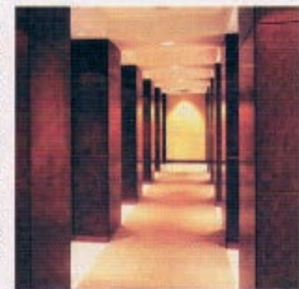
Continental Woodworking Co., p. 55

FOCUS ON FINISHING MATERIALS 9 W&WP presents materials for finishing, correcting damage and making repairs.