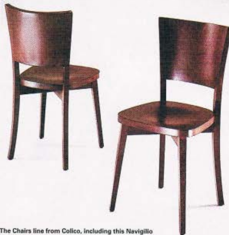
The Chairs line from Colico, including this Navigilio chair featured in the Italian pavilion, includes pieces that can be used in kitchens, living rooms, bars, restaurants, hotels and outdoors as well as in the office.