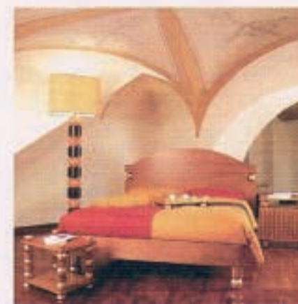
Design Lines, p. 36