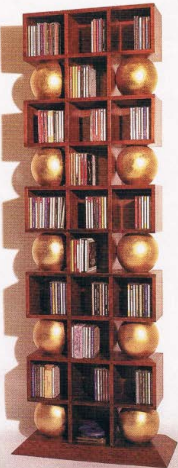
The Pianeti CD shelf from Massimo Caggiano is featured along with the Zeus dining table, the Puck night stand and the Le Lune chest of drawers. All incorporate gold-leaf geometrical decorative elements.

The annual Chicago Design Show featured a pavilion of contemporary Italian design.