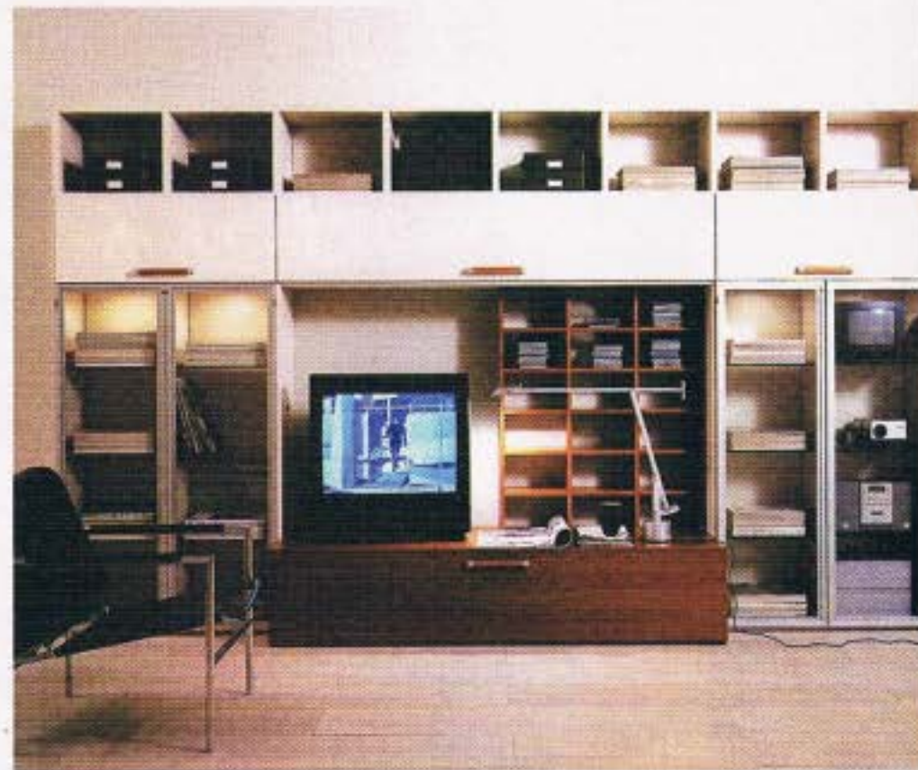
The Selecta wall-mounting shelf system offers versatility.

A Selecta wall-mounting shelf system, for example, has everything the program has to offer: bookcases, shelves, drawers, cabinets with glass doors, sliding doors, along with a matching TV console with sliding smoked-glass doors.