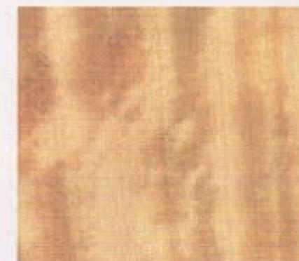
Wood of the Month, p. 41